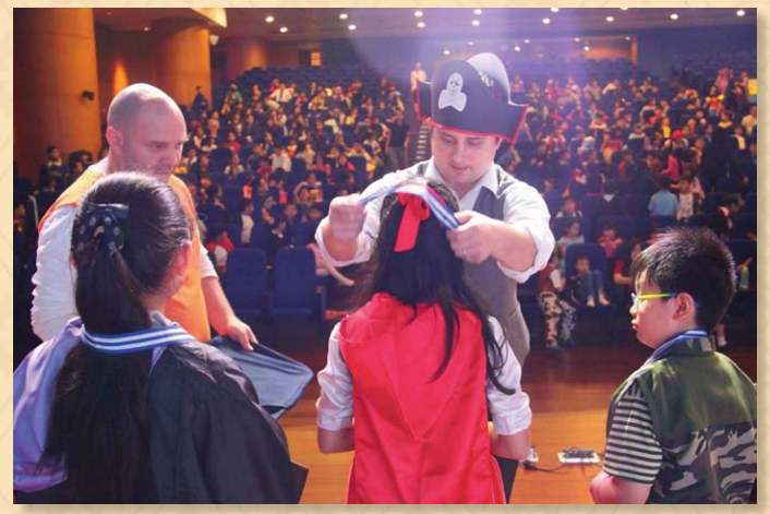
Students are presented with awards after participating in the Spelling Bee competition