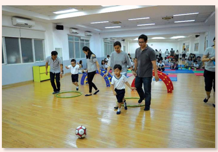
▲ Hula hoop relay game