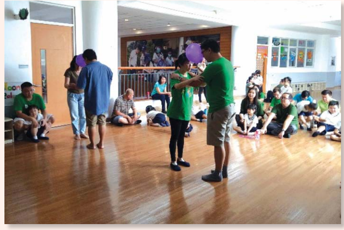
▲ Balloon Relay