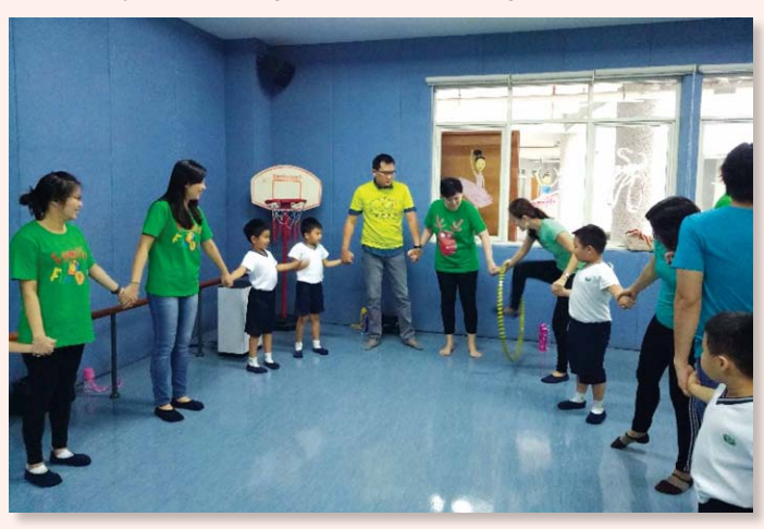
▲ Obstacle Course game