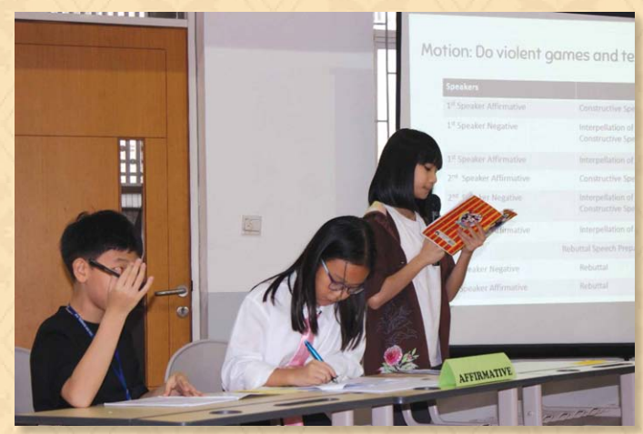
P6 Harmony compete in a class debate

students pull out their novels and read before the next class starts. We look forward to continuing to promote literacy and a deep love for reading in our daily lessons and activities. Thank you to all teachers and members of the administration at Tzu Chi Primary School who made this event fruitful and worthwhile for our students!