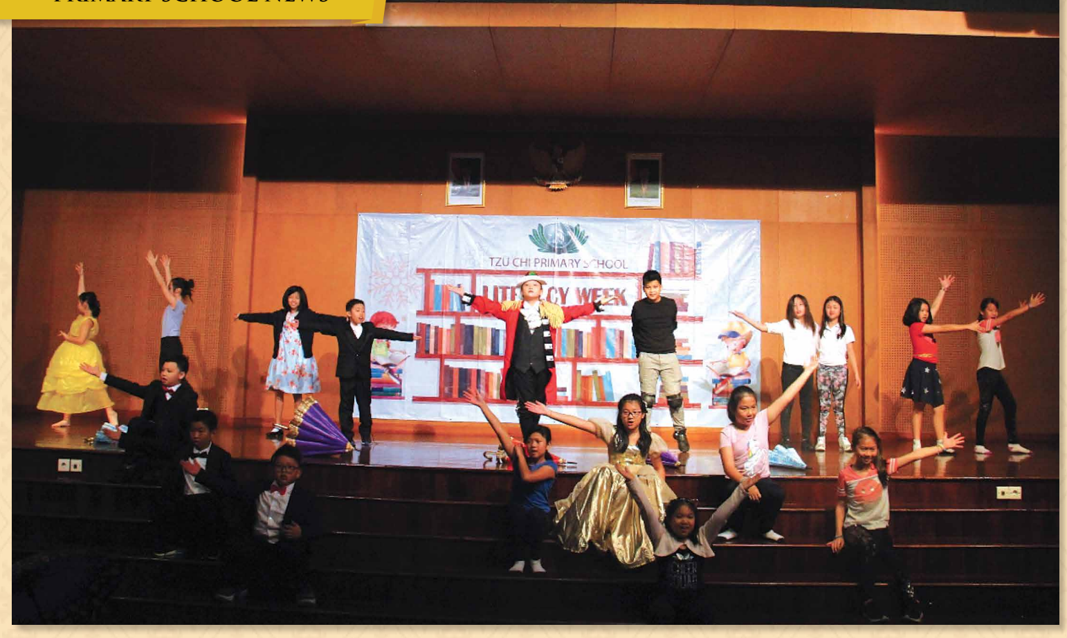
▲ The opening ceremony of the Literacy Week Event got students motivated and excited for the activities of the day