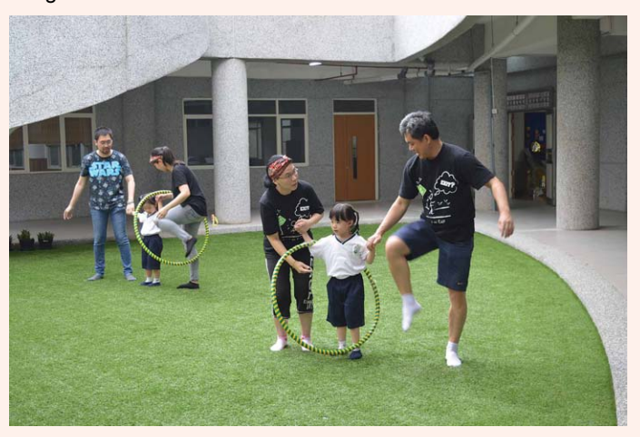
▲ Super mom & dad made their kid happy