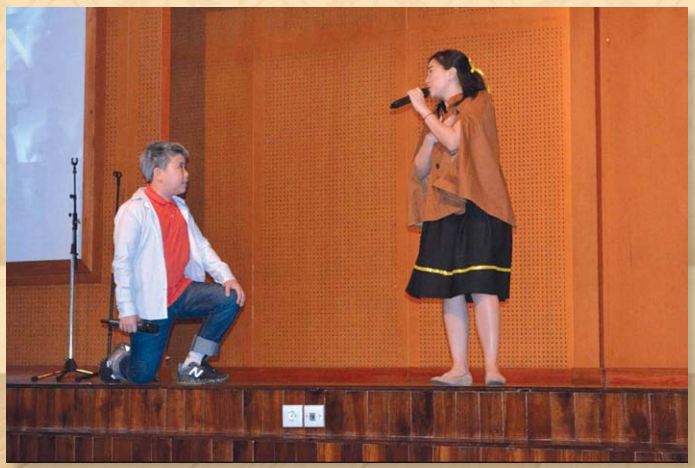
Two students sing during the opening ceremony of the Literacy Week Event