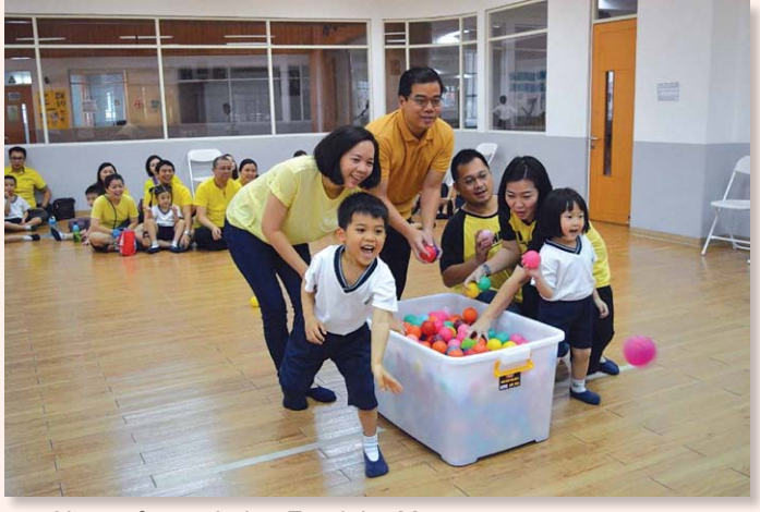
▲ Happy faces during Feed the Monster game