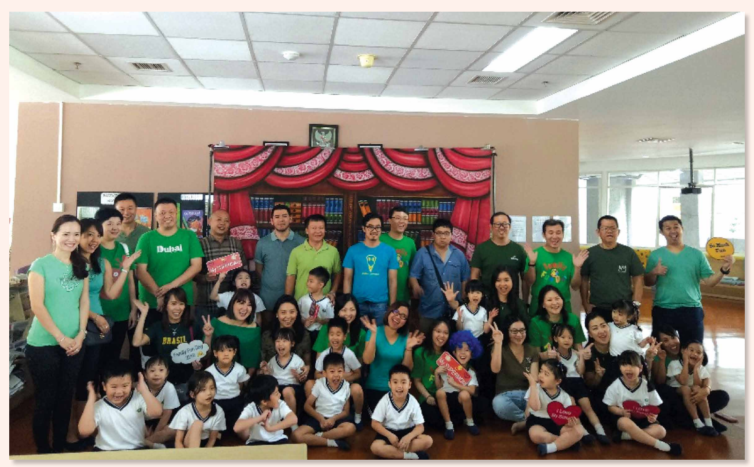
Class family picture