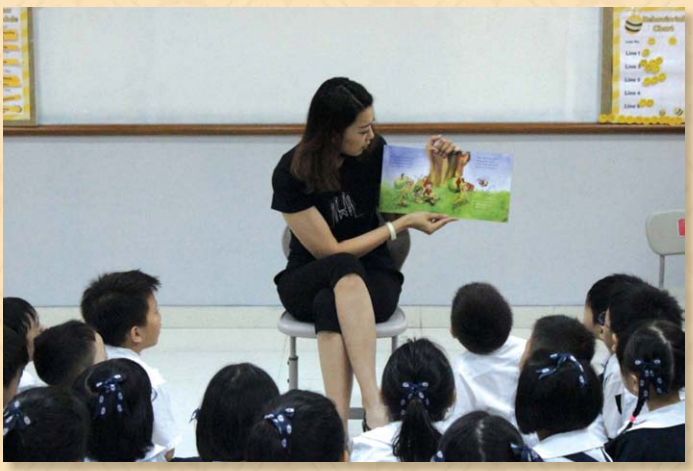
Parents help out by reading stories to students